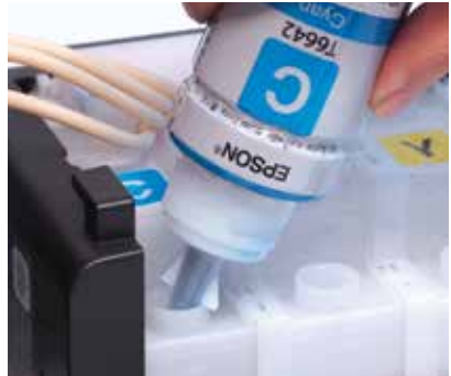
Smart tip design for easy, mess-free refills