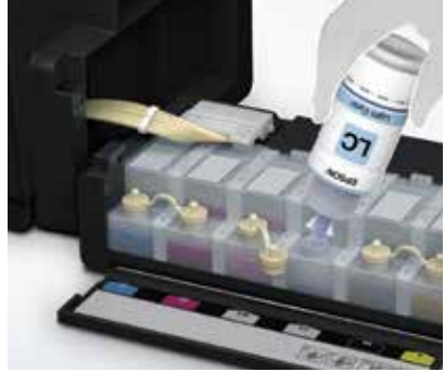
Specially fitted tubes ensure reliable ink flow without leakage

Epson's original ink tank system is engineered for easy, mess-free refills. The special tubes in the printer are designed to ensure smooth and reliable ink flow at all times.